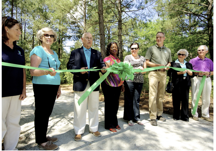
Above: TRLC staff join Mayor Donald Morris (with scissors), officially opens the new nature trail in Tarboro with cutting of the ceremonial ribbon.

The ribbon cutting ceremony took place at the entrance to the trail on E. St. James Street one block east of Panola Street. Visit http://vimeo.com/43937839 to see a video of the ribbon cutting with remarks from Mayor Donald Morris.